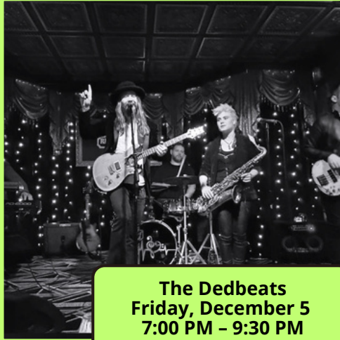
The Dedbeats Friday, December 5 7:00 PM – 9:30 PM