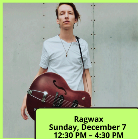
Ragwax Sunday, December 7 12:30 PM – 4:30 PM