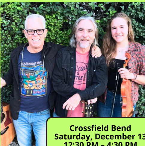
Crossfield Bend Saturday, December 13 12:30 PM – 4:30 PM