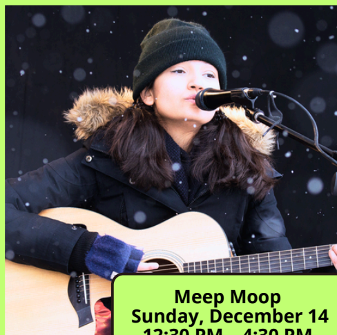
Meep Moop Sunday, December 14 12:30 PM – 4:30 PM