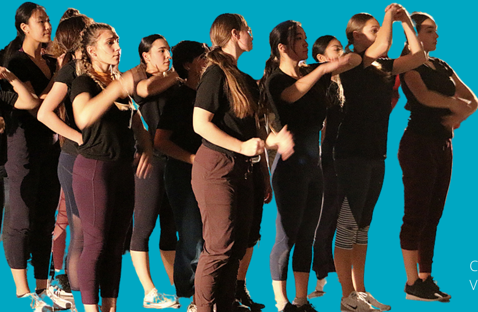
Cawthra Repertoire Dancers, InSitu 2018

CreativeHub 1352 is a catalyst for change that fosters the advancement of creative endeavours, human potential, and place-making in communities.