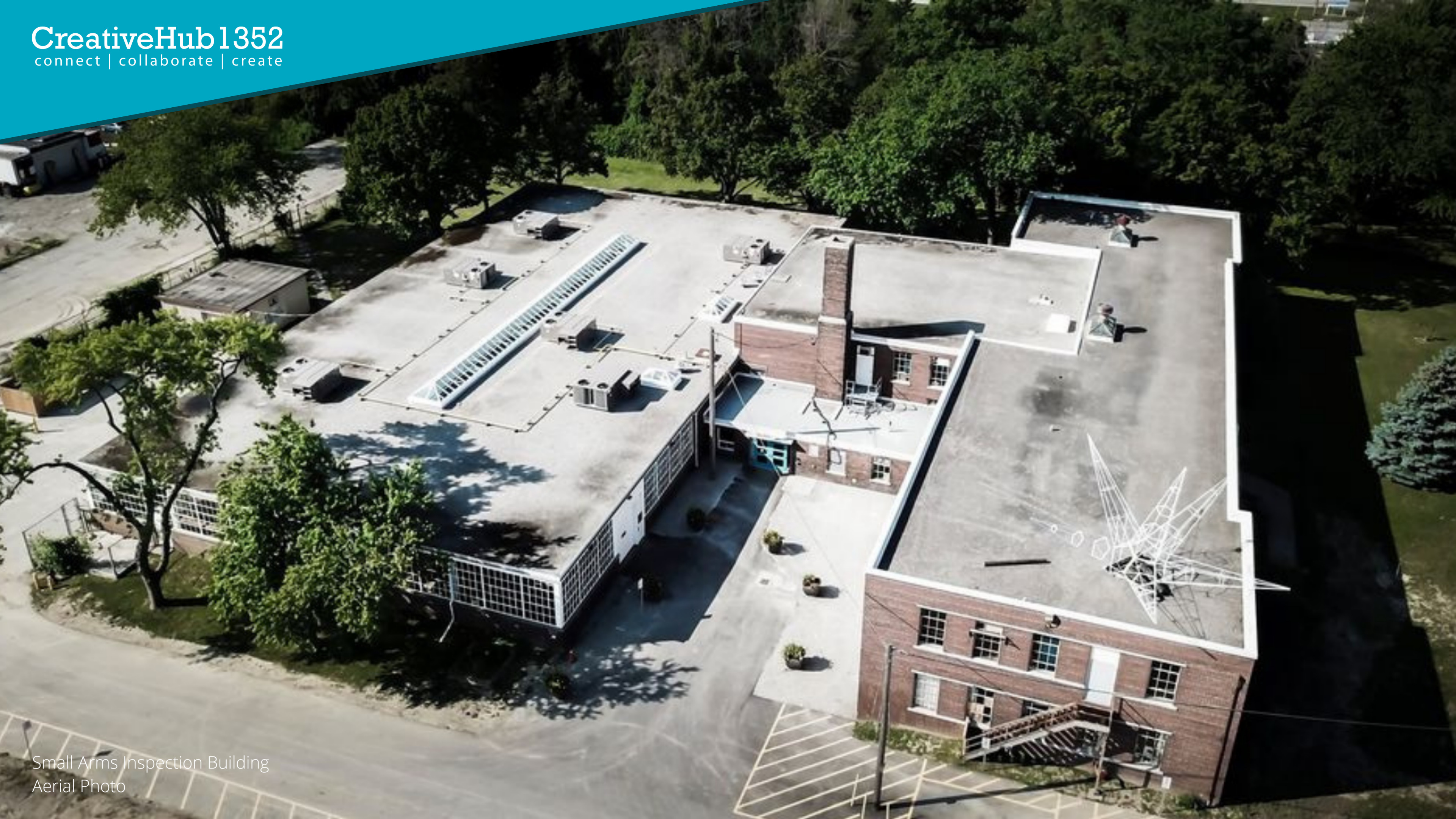
Small Arms Inspection Building Aerial Photo